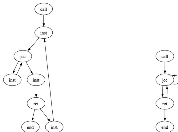
Figure 2: CFG reduction