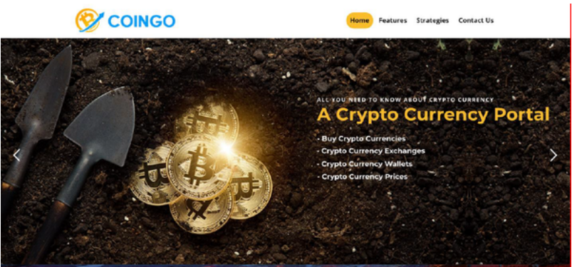
Figure 2 - Screenshot of the "CoinGoTrade" website.

Investigation revealed the IP address 198.54.114.175 was hosted at NameCheap, but no records were available at the time of writing.