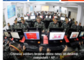
Chinese soldiers browse online news on desktop computers